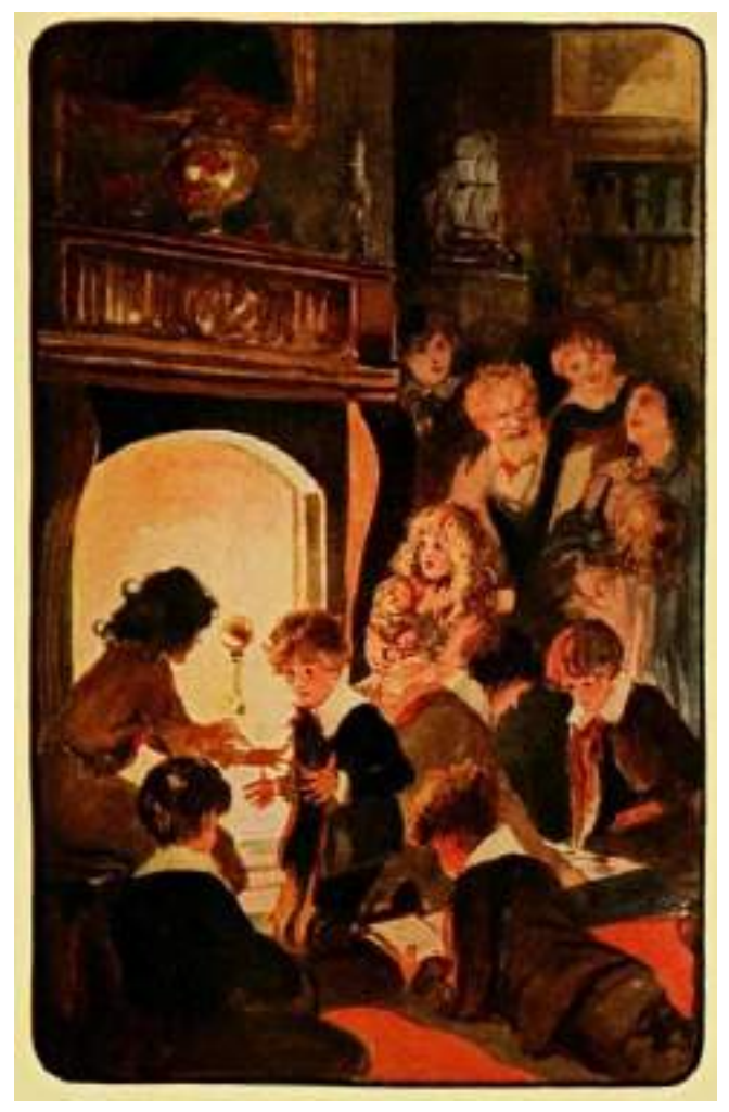
All were glad to gather round the hearth, as the evenings grew longer. Page 312.

One evening, when the small boys were snugly tucked in bed, and the older lads were lounging about the school-room fire, trying to decide what they should do, Demi suggested a new way of settling the question.