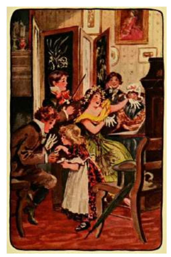
Miss Smith accompanied herself with a vigor which made the old desk rattle. Page 135.

"I guess we had better go," said Demi, suddenly, as Aunt Jo's voice was heard on the stairs.